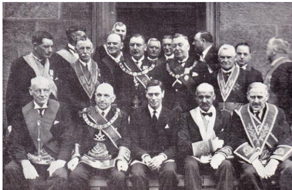
The occasion of the affiliation of H.R.H. The Duke of York (later King George VI) into the Lodge of Glamis No. 99 on the 2nd June 1936